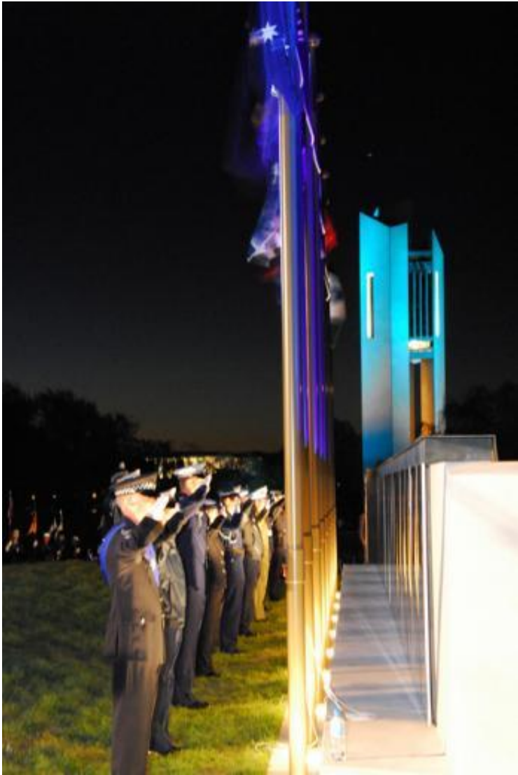
National Police Memorial Dedication 2006