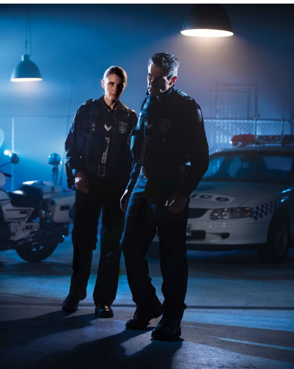
Promotional image for the telemovie Dark Blue .