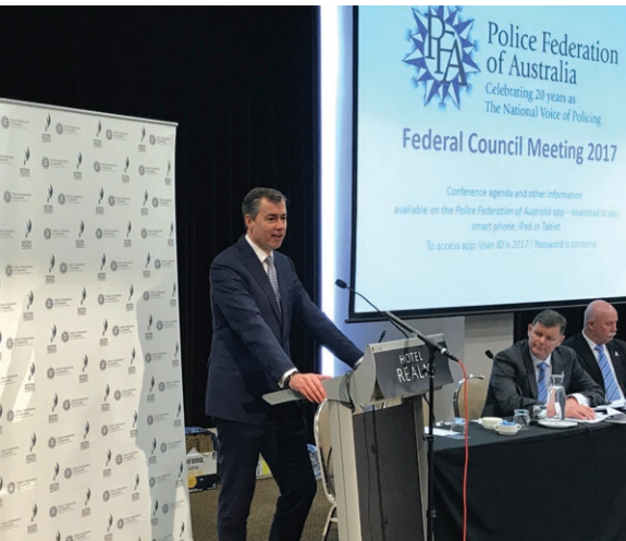
Minister Keenan making the National Awareness Campaign announcement at the 2017 Federal Council Meeting.

In 2017, when the Federal Government first entered into discussions with the PFA over the establishment of a campaign on the mental health and well-being of serving police officers, and in particular focussing on relief of their suffering, thereby assisting them to return to early active duty, the Government sought to provide the funds for the Campaign to the NPM.