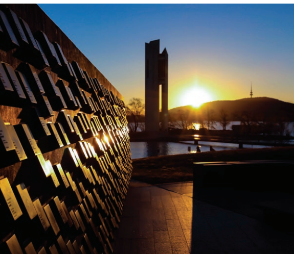
National Police Memorial.