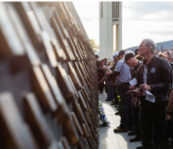
2015 Wall to Wall participants at the National Police Memorial.

I am pleased to present the Treasurer's report for the financial year ended 30 June 2019.