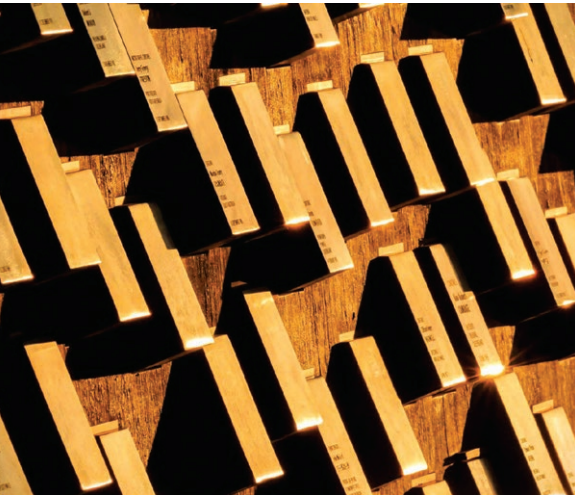
National Police Memorial.