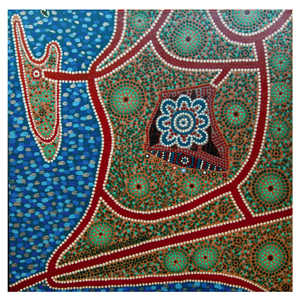
Gurumbul Gandjawan (translation Valiant Policeman) by Detective Sergeant Stephen Raper, 2020.

The story of this painting represents the National Police Memorial and surrounding country. It shows a sitting circle with people gathered around a campfire with the colours symbolic of the 'chequered ribbon'. The people are representative of each Commissioner of the eight Australian Police Force/Services with each state flag also shown. The wall of remembrance takes the form of a shield which is indicative the fallen officers are protectors. The red ground symbolises the blood and body that has been sacrificed by the fallen and how they have been interred into mother earth with the paths their journeys there.